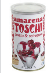
Amarena Cherries Pack Size: 400g Price: £5.95