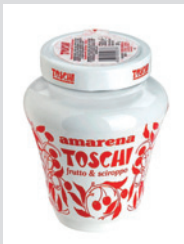
Amarena Cherries Pack Size: 540g Price: £9.50