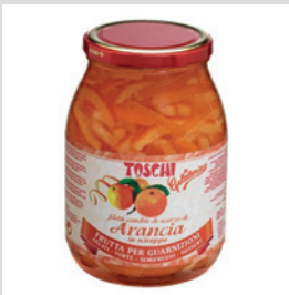
Candied Orange Peel In Syrup Pack Size: 1.35Kg