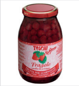
Strawberries In Syrup Pack Size: 1.35Kg