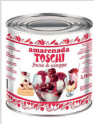
Amarena Cherries Pack Size: 2.75Kg Price: £27.95