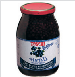
Blueberries In Syrup Pack Size: 1.15Kg