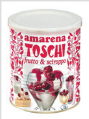
Amarena Cherries Pack Size: 1Kg Price: £12.50