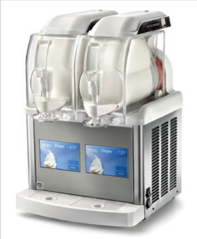
Table Top Ice Cream